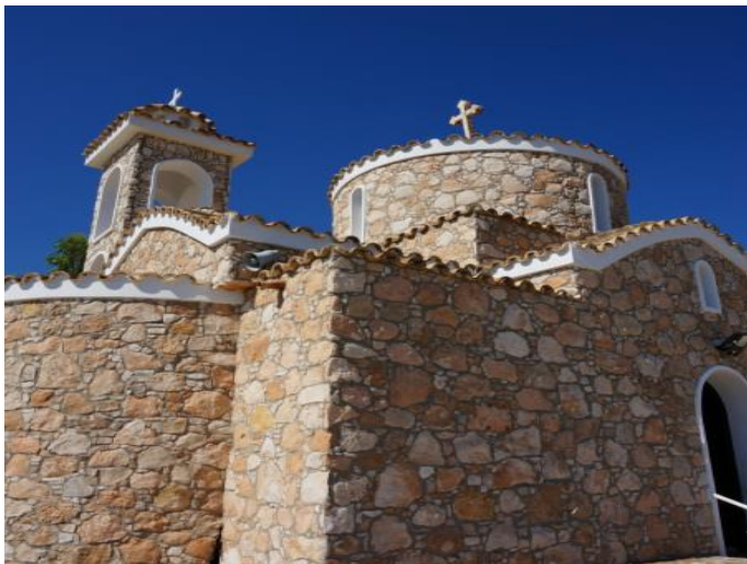
A Greek Orthodox Church on the Island of Cyprus.

Please see below for a couple of recent photographs featured on Craig's Blog: