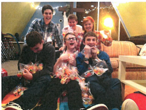
The Youth Group prepared 100 candy bags for those who served the hot lunch to give out at the Front Room for the Holy Saturday Lunch

We thank the following parishioners for their ongoing work in this Ministry: